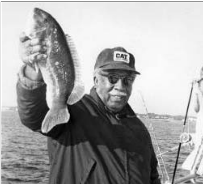
Blackfish bite best in spring and fall. (Photo by Hank Wurzbarger).

D/N: 609-884-1227 April - December; Three-quarter Day, Half-Day, Full-Day, Overnight Fluke, Tuna, Billfish (canyon), Weakfish, Striped Bass, Wreck/Reef, Shark, Bluefish, Night Bluefish, Sea Bass, Drum, Kingfish, Spanish Mackerel Evening Cruise, Whale Watching, Bird Watching, Weddings, Dinner Cruise, Environmental Observations