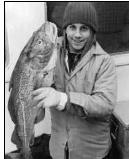
Codfish are taken in cold, deep waters.

Captain Carlson , Charter, 30' Capt. Rick Herishen, 104 East Wisteria Road, Wildwood Crest, NJ 08260 D: 609-522-0177 June - September; Half-Day, Full-Day Fluke, Weakfish, Wreck/Reef, Shark, Bluefish