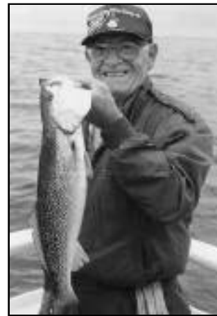
Weakfish are fall favorites.