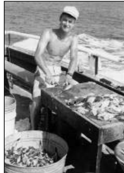
Don't forget to tip the mate.

Fluke, Tuna, Weakfish, Striped Bass, Wreck/Reef, Shark, Bluefish, Night Bluefish