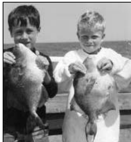
Triggerfish look strange, but taste great.