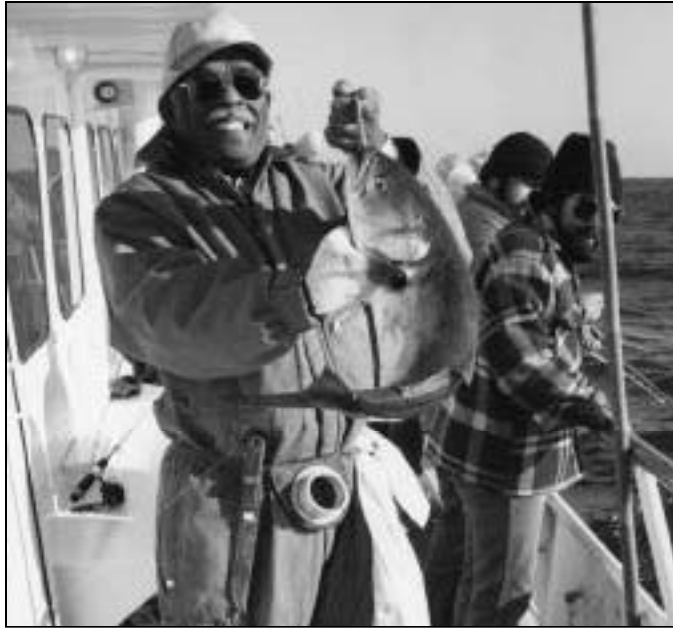
Bluefish are fighters.