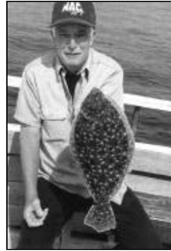
Fluke are one of New Jersey's premiere gamefish.

www.dukeofluke.com/ email: info@dukeofluke.com