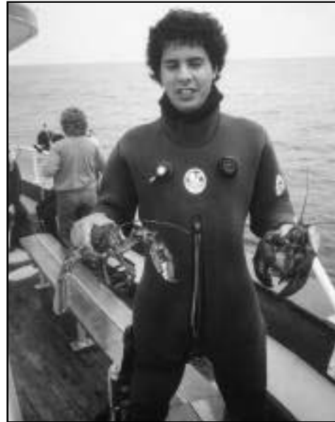
New Jersey divers catch nice lobsters.

D: 609-492-1005 B: 609-709-0226 April - December; Three-quarter Day, Half-Day, Full-Day, Overnight Fluke, Wreck/Reef, Tuna, Billfish (canyon), Shark, Weakfish, Bluefish, Striped Bass Evening Cruise