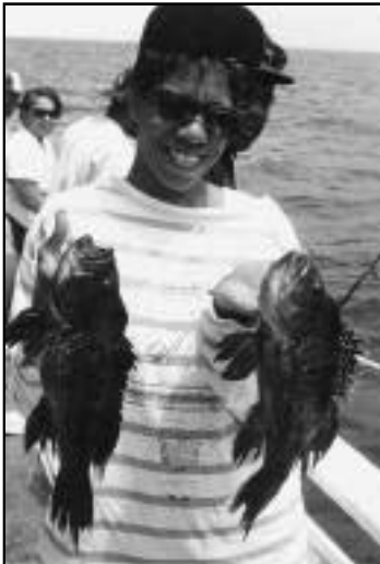
Sea bass are caught on wrecks and reefs.

January - December; Three-quarter Day, Half-Day, Full-Day Fluke, Weakfish, Striped Bass, Wreck/Reef, Shark, Bluefish, Night Bluefish Scuba Diving, Evening Cruise, Dinner Cruise, Whale Watching, Bird Watching, Weddings, Environmental Observations