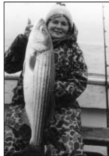
A Delaware Bay striper