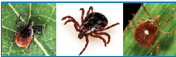
Black-legged “deer” tick