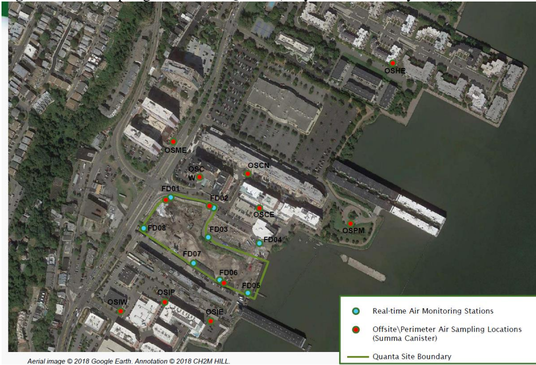
Figure 3: Air sampling network at Quanta (May 10, 2018 – July 2018)

Summarized below are steps taken to change work practices to reduce odors prior to May 18, 2018: