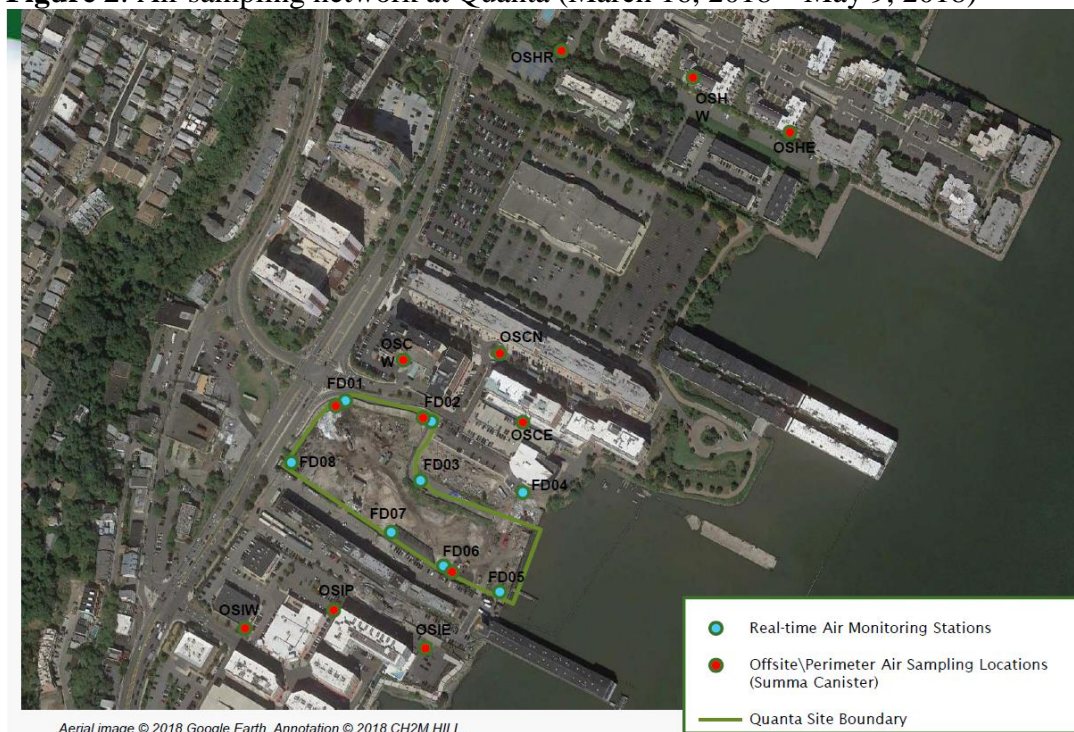
Figure 2: Air sampling network at Quanta (March 16, 2018 – May 9, 2018)

Real-time air monitoring, meteorological monitoring, and air sampling have been ongoing at the site since intrusive activities began in May 2017. Honeywell, in response to direction from USEPA, has adjusted the air monitoring based on observed detections of naphthalene. These adjustments have included: