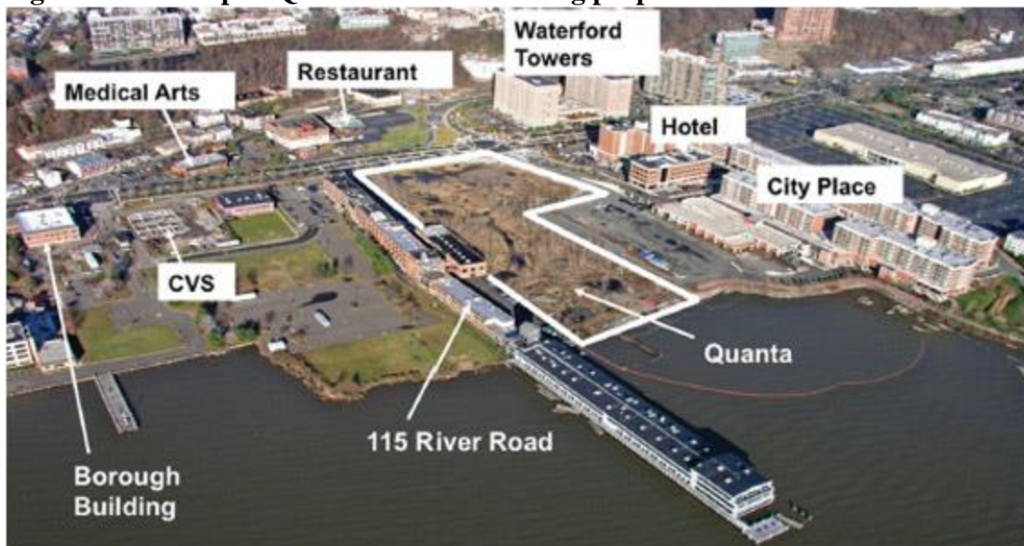
Figure 1: Site Map of Quanta and surrounding properties