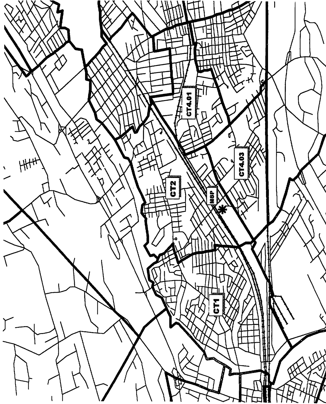
Figure 1. Middlesex Sampling Plant (MSP) and Census Tracts 1 and 2 in Middlesex Boro and 4.01 and 4.03 in Piscataway Township