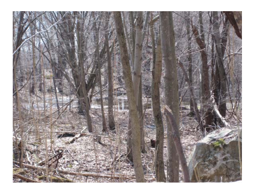
Figure 7: Dump Area B at Mansfield Trail Dump site