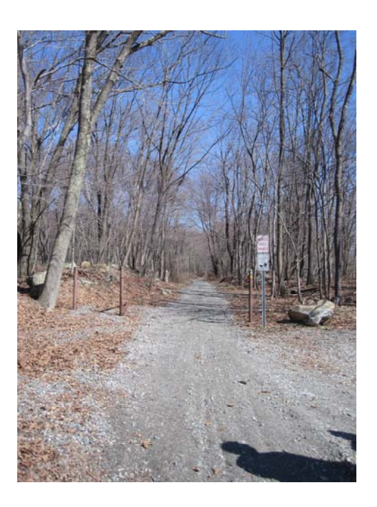
Figure 4: Pedestrian path at Mansfield Trail Dump site

Figure 3: Bike path at Mansfield Trail Dump site