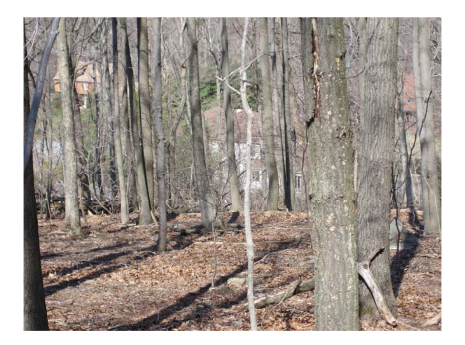
Figure 5: Homes near Dump Area A at Mansfield Trail Dump site