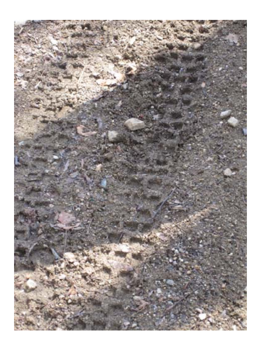
Figure 2: Motorbike tire tracks on-site at Mansfield Trail Dump site

Figure 1: ATV tire tracks on-site at Mansfield Trail Dump site