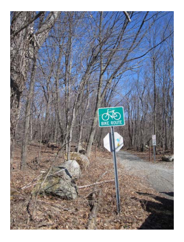
Figure 3: Bike path at Mansfield Trail Dump site