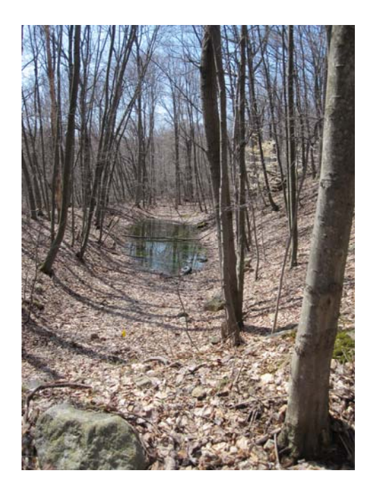
Figure 6: Dump Area B at Mansfield Trail Dump site