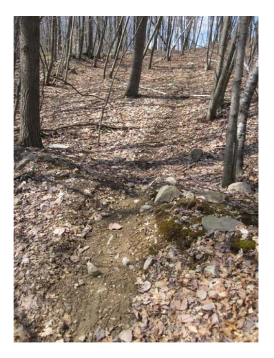
Figure 1: ATV tire tracks on-site at Mansfield Trail Dump site