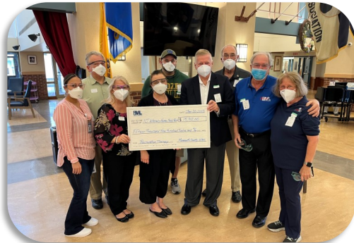
The Bowlers to Veterans Link (BVL) donated $15,912.00 to purchase a new Bingo machine and an Omnicycle for the Rehabilitation Gym

New Jersey Veterans Memorial Home at Menlo Park, 132 Evergreen Road , Edison, NJ 08818 732-452-4100